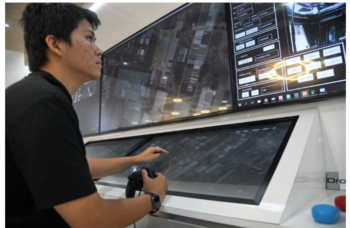
An engineer monitors a live video feed sent by a surveillance drone at a command centre in Singapore