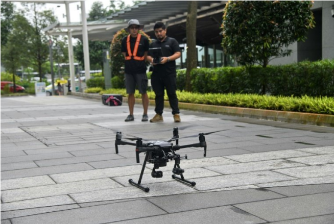
Companies in Singapore have already started testing drones for commercial use

Hi-tech Singapore is planning to roll out a swarm of drones for tasks that include delivering parcels, inspecting buildings and providing security, but safety and privacy concerns mean the initiative may hit turbulence.