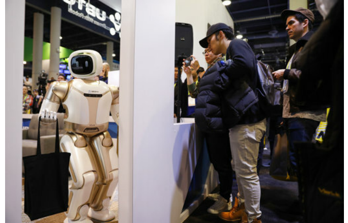
The Walker robot stands in a doorway during a demonstration at the Ubtech booth at CES International, Wednesday, Jan. 9, 2019, in Las Vegas.