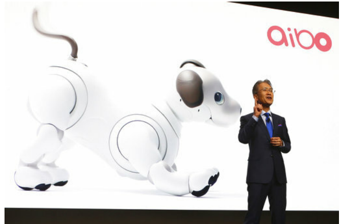
Sony President and CEO Kenichiro Yoshida speaks at the Sony news conference at CES International with the Sony robotic dog Aibo projected behind him, Monday, Jan. 7, 2019, in Las Vegas.