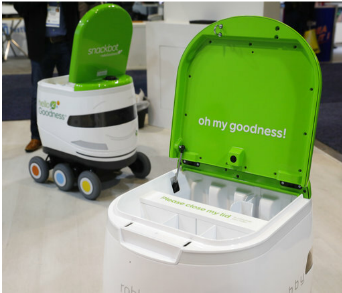
The Robby robot is on display at the Robby booth at CES International, Wednesday, Jan. 9, 2019, in Las Vegas.