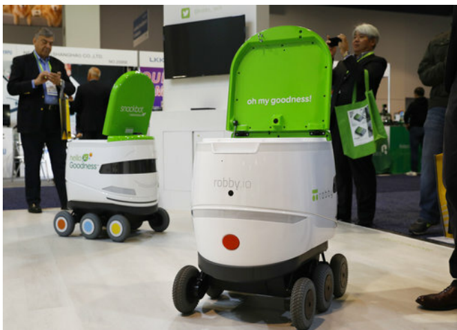
The Robby robot is on display at the Robby booth at CES International, Wednesday, Jan. 9, 2019, in Las Vegas.

Samsung is coming out with a robot that can keep its eye on grandparents.