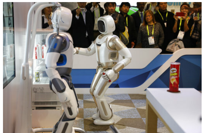
The Walker robot grabs a soda can during a demonstration at the Ubtech booth at CES International, Wednesday, Jan. 9, 2019, in Las Vegas.