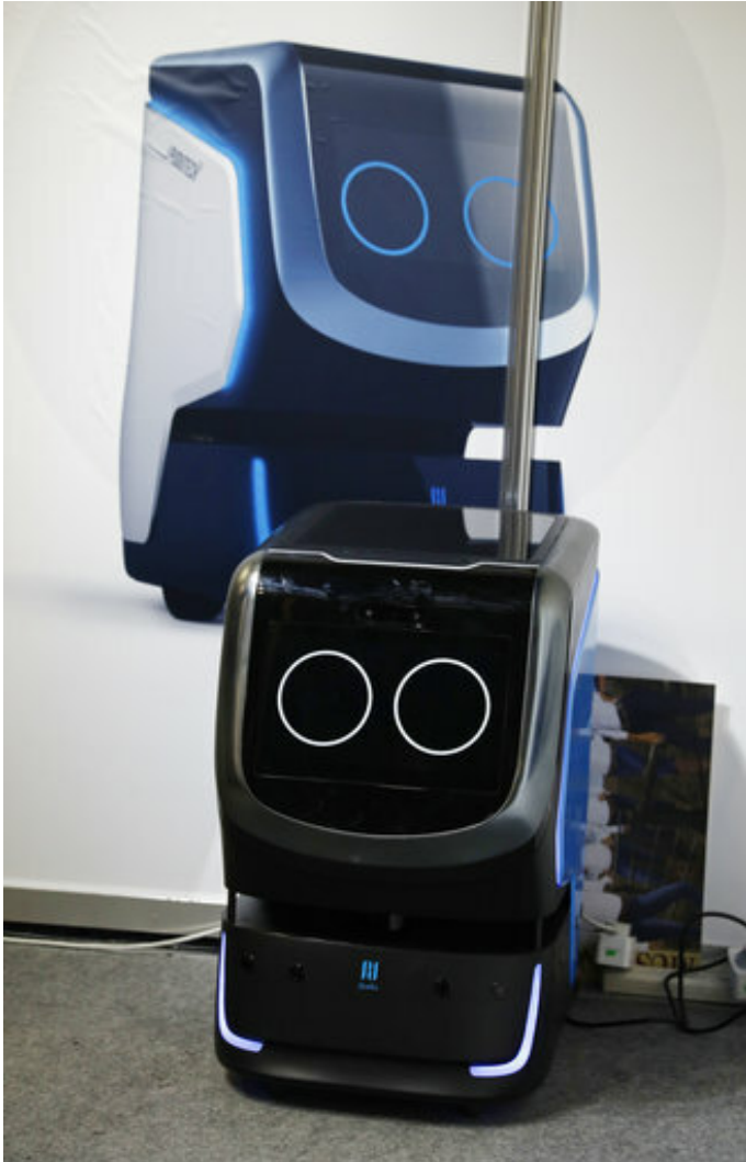
The Holabot is on display at the Pudu booth at CES International, Wednesday, Jan. 9, 2019, in Las Vegas.