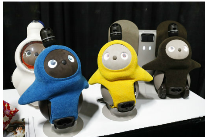
Lovot companion robots are on display at the Groove X booth during CES Unveiled at CES International, Sunday, Jan. 6, 2019, in Las Vegas.