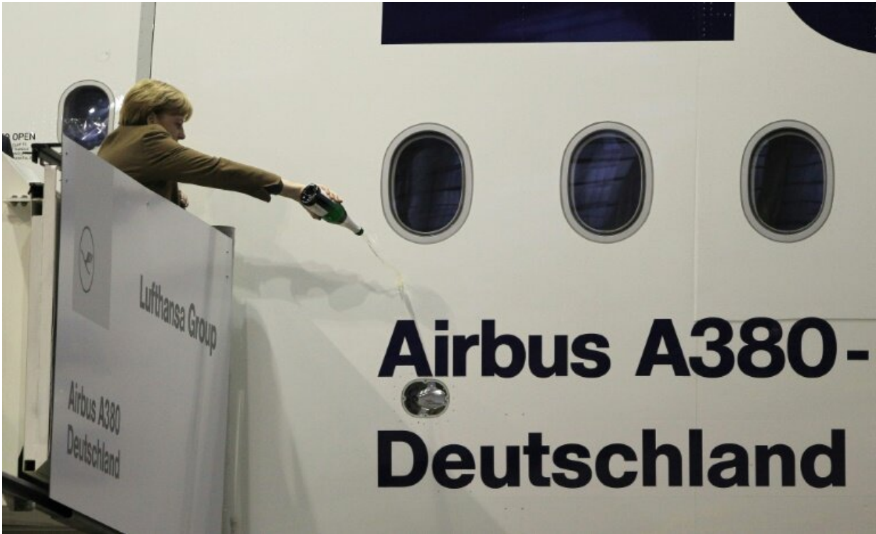
German Chancellor Angela Merkel christens an Airbus A380 aircraft in 2015