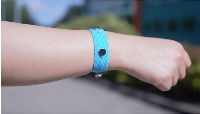
One of the prototype smart materials wrist bands.

Smart wearable technology that changes colour, heats up, squeezes or vibrates as your emotions are heightened has the potential to help people with affective disorders better control their feelings.