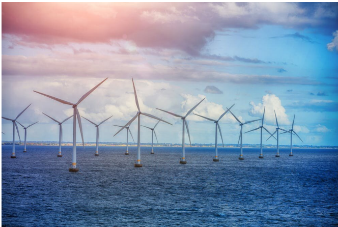
Offshore turbines are typically much larger than onshore towers.

One of the largest wind turbine designs in the world, General Electric's offshore 12-megawatt Haliade-X , has 107m blades and a total height of 260m. As a comparison, Sydney's Centrepoint tower is 309m tall.