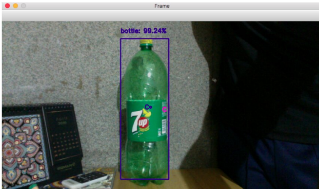
A demonstration of the system's distance approximation.

Numerous countries worldwide are currently facing major problems related to waste collection, particularly in urban areas, due to the large amount of waste generated daily by the population. Technology could play a significant role in tackling these issues, for instance, through the development of more effective tools to gather and collect garbage.