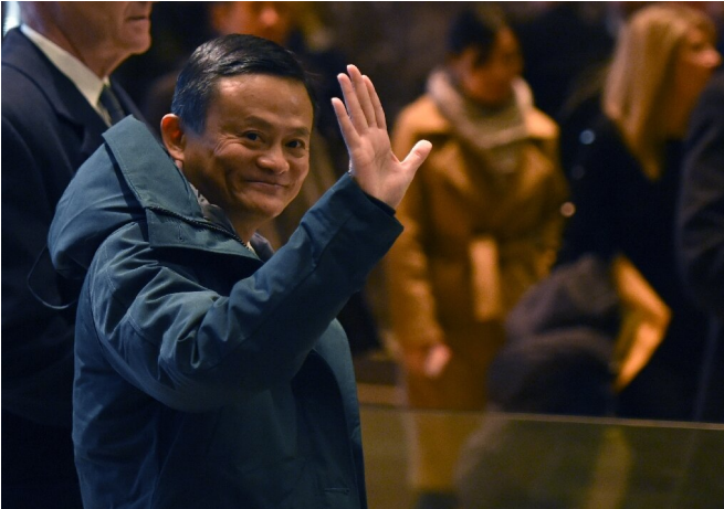
Jack Ma is waving goodbye to Alibaba after 20 years at the helm

Jack Ma steps aside on Tuesday as chairman of Alibaba, ending a spectacularly successful 20-year run during which the charismatic former English teacher's e-commerce company left a profound impact on China's economy.