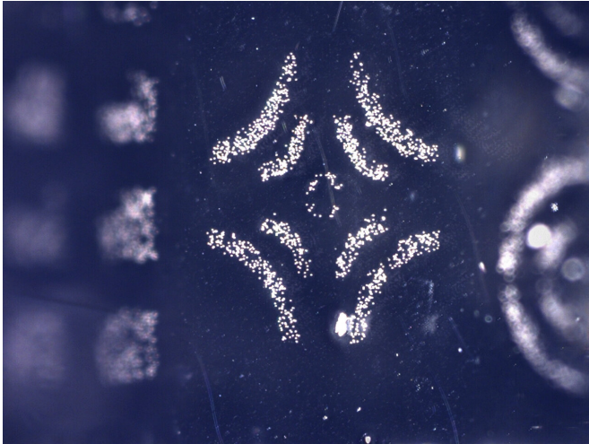
Optical image of a pattern of silicon dioxide particles, each 5 micrometers in diameter, and individually picked and placed using a new "electroadhesive" stamp.

If you were to pry open your smartphone, you would see an array of electronic chips and components laid out across a circuit board, like a miniature city. Each component might contain even smaller "chipllets," some no wider than a human hair. These elements are often assembled with robotic grippers designed to pick up the components and place them down in precise configurations.