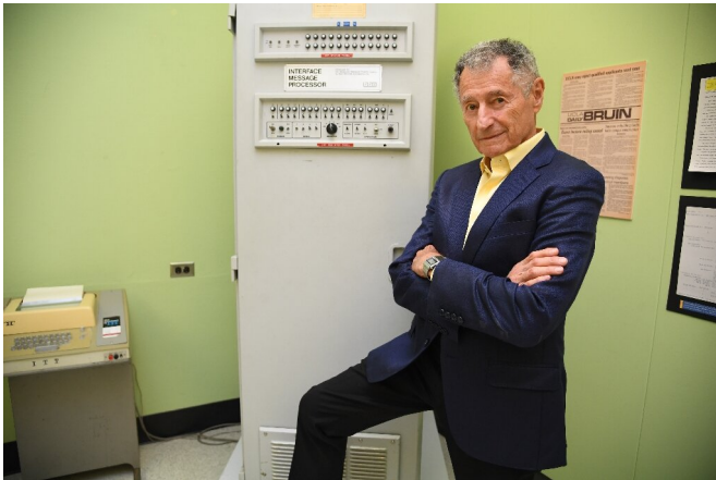
Leonard Kleinrock poses beside the first Interface Message Processor (IMP) in the lab where the first internet message was sent, at the University of California Los Angeles

On October 29, 1969, professor Leonard Kleinrock and a team at the University of California at Los Angeles got a computer to "talk" to a machine in what is now known as Silicon Valley.