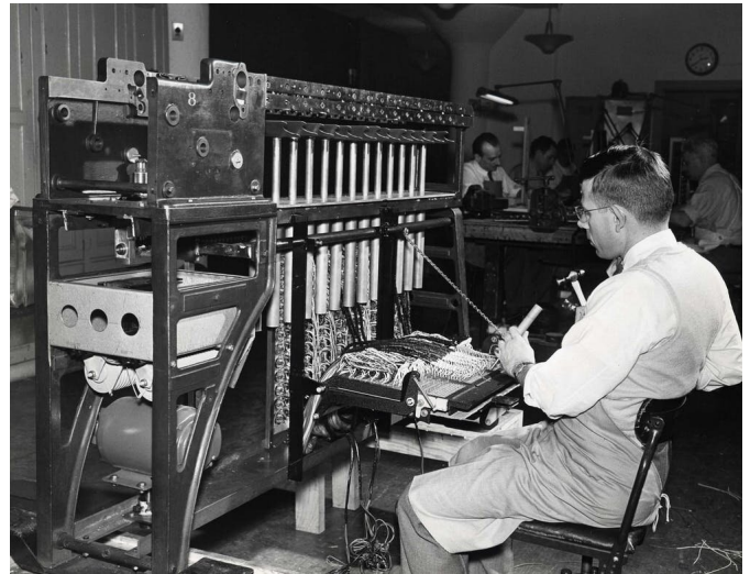
This 'mechanical punch card sorter' was used for the 1950 census.

The count proceeded so rapidly that the state-by-state numbers needed for congressional apportionment were certified before the end of November 1890.