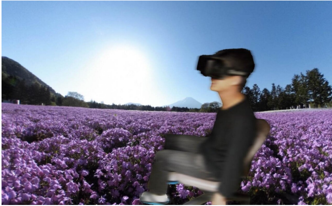
Image of virtual walking.