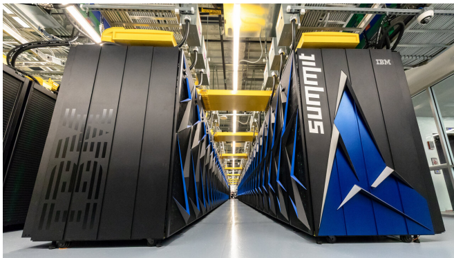
Summit — Oak Ridge National Laboratory's 200 petaflop supercomputer.

Scientists have processed 400 gigabytes of data a second as they tested data pipelines for the Square Kilometre Array (SKA) telescope.