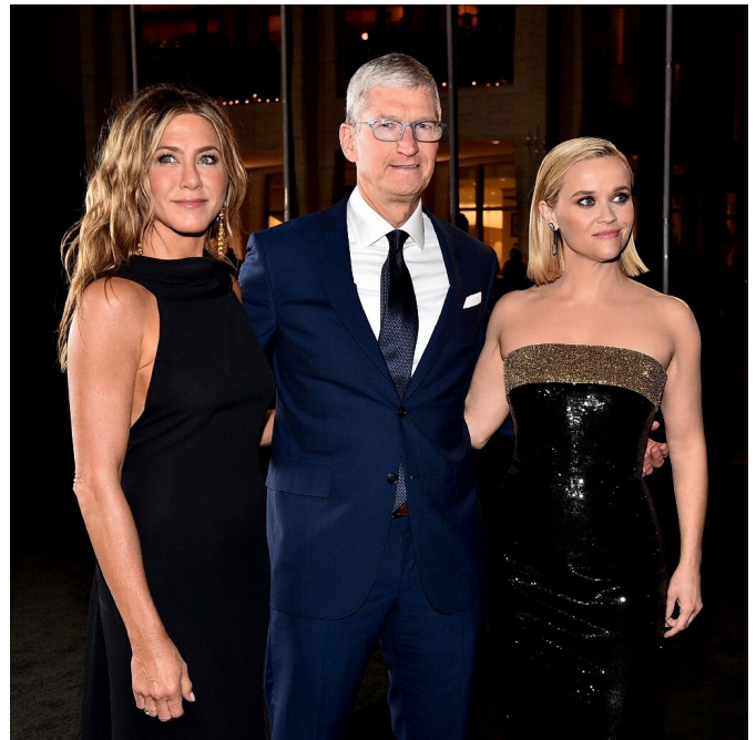
Jennifer Aniston, Apple CEO Tim Cook and Reese Witherspoon attend Apple TV+'s "The Morning Show" world premiere

The first Apple TV box for streaming shows from the internet to its devices or television sets was released some 12 years ago, with the company long downplaying it as "a hobby."