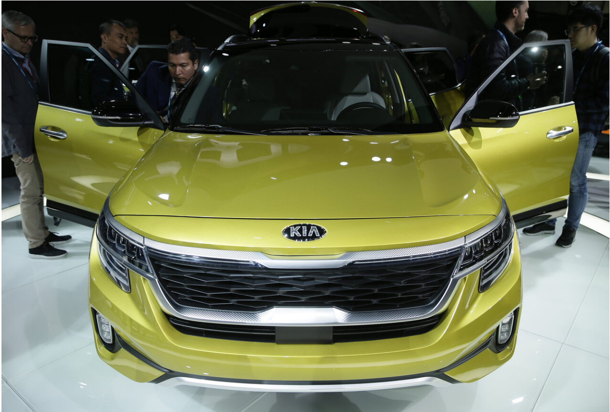
KIA introduces the All-New 2021 Kia Seltos at the AutoMobility LA Auto Show in Los Angeles, Wednesday, Nov. 20, 2019.