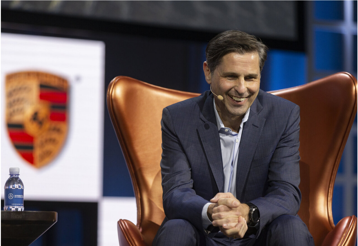
Klaus Zellmer, president and CEO Porsche Cars North America, smiles during a panel called "Racing The Future: How Porsche Sees The Road Ahead," at the AutoMobility LA Auto Show in Los Angeles, Tuesday, Nov. 19, 2019.