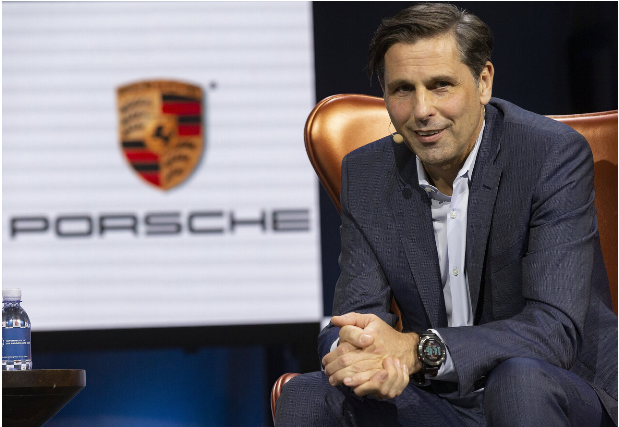
Klaus Zellmer, president and CEO Porsche Cars North America, smiles during a panel called "Racing The Future: How Porsche Sees The Road Ahead," at the AutoMobility LA Auto Show in Los Angeles, Tuesday, Nov. 19, 2019.