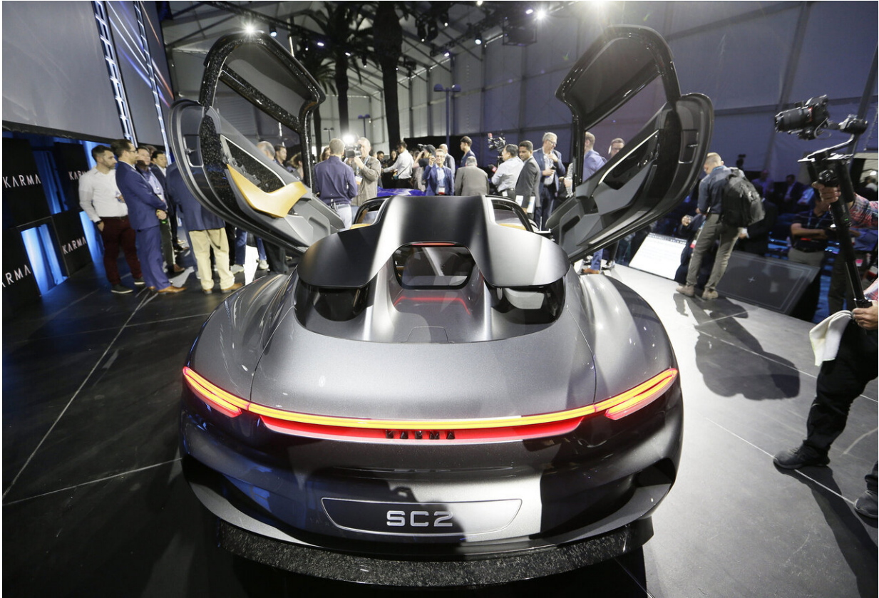
Karman Vision SC2 concept vehicle is displayed at Automobility LA Auto Show in Los Angeles, Tuesday, Nov. 19, 2019.