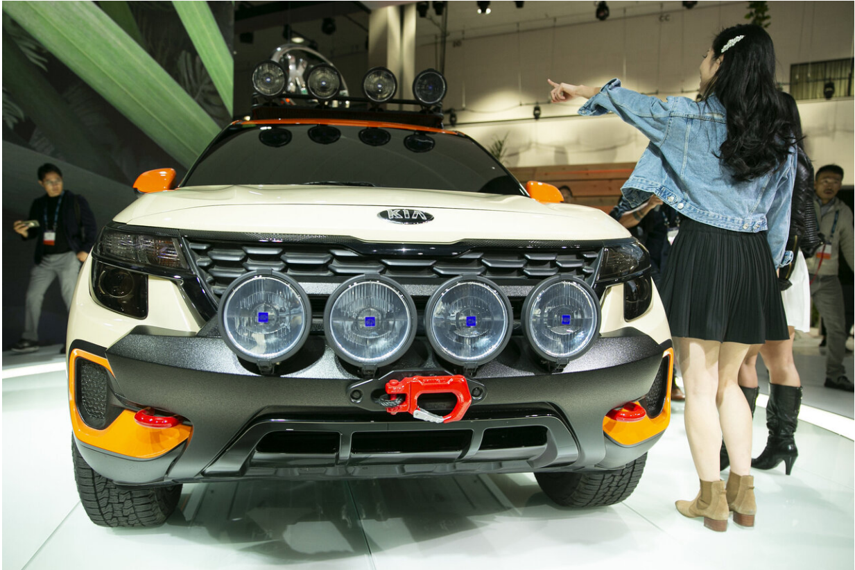
KIA introduces the All-New 2021 Kia Seltos at the AutoMobility LA Auto Show in Los Angeles, Wednesday, Nov. 20, 2019.