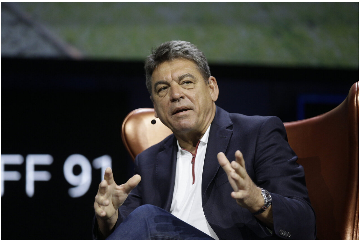
Dr. Carsten Breitfeld, Global CEO of Faraday Future, talks during the technology panel "Faraday's Future: Transforming The Road of Future

battery power alone before the gas-electric hybrid propulsion system kicks in. It will get the equivalent of 90 miles per gallon (38 kilometers per liter) of gasoline, according to Toyota. Yet the 302-horsepower system will take the car from zero to 60 mph (97 kph) in 5.8 seconds—a full two seconds faster than the current RAV4 Hybrid. The SUV, which is the top-selling vehicle in the U.S. that isn't a pickup truck, has a tuned-up version of the RAV4 Hybrid's 176 hp 2.5-liter four-cylinder gas engine powering the front wheels. A separate rear-mounted electric motor powers the rear wheels when needed. Toyota says the battery is mounted under the floor, giving the SUV a lower center of gravity and improving its handling. The RAV4 Prime goes on sale in the summer. The price wasn't announced.