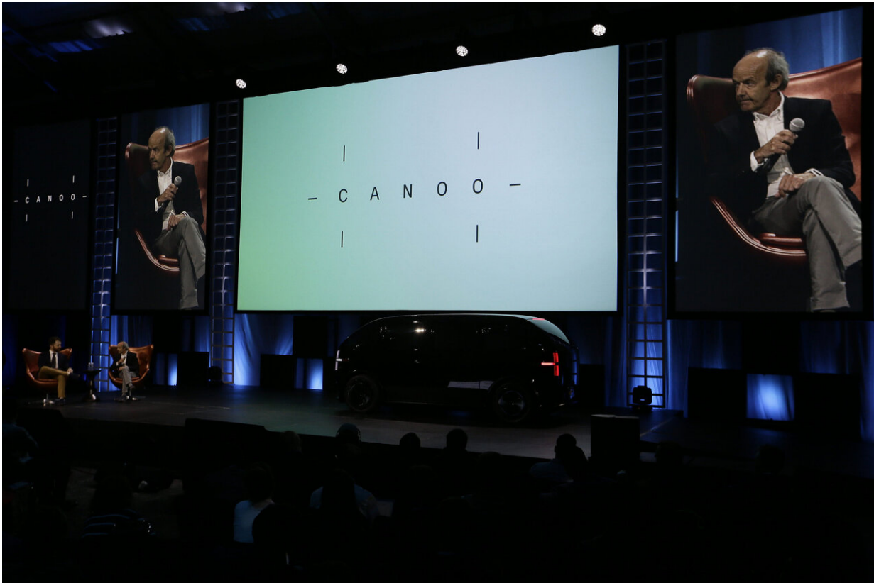
Ulrich Kranz, co-Founder & CEO of Canoo, unveils its first electric van model, Canoo, an electric vehicle (EV) for subscription only, at AutoMobility LA auto show in Los Angeles, Tuesday, Nov. 19, 2019.