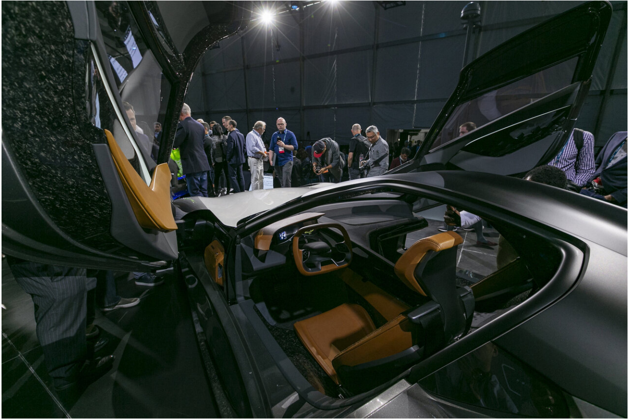
Karman Vision SC2 concept vehicle interior is seen at Automobility LA Auto Show in Los Angeles Tuesday, Nov. 19, 2019.