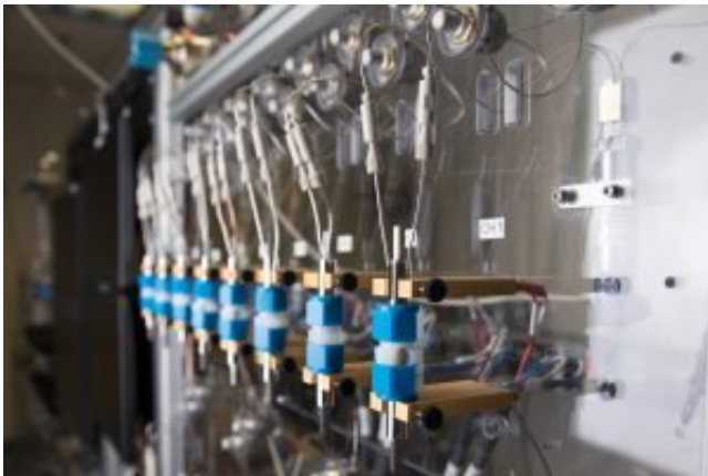
A differential electrochemical mass spectroscopy (DEMS) System in the IBM Research Battery Lab, which measures the amount of gas that has evolved from a battery cell during charging and discharging cycles.

Overall, this battery has shown the capacity to outperform existing lithium-ion batteries not only in the previously listed applications, but can also be optimized for a range of specific benefits, including: