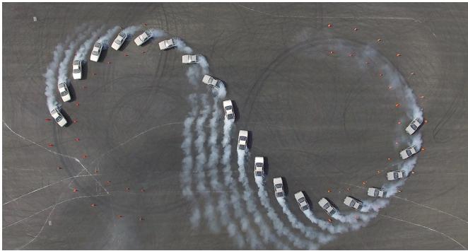
Superimposed frames, at 0.5-second intervals, from an overhead video of a successful, fully autonomous "Figure 8" drifting experiment on MARTY. This experiment is conducted at speeds of 50km/h, and transitions through +/- 40 degrees of sideslip in about a second.

"Suddenly the car is pointed in a very different direction than where it's going. Your steering wheel controls the speed, the throttle affects the rotation, and the brakes can impact how quickly you change directions," Goh said. "You have to understand how to use these familiar inputs in a very different way to control the car, and most drivers just aren't very good at handling the car when it becomes this unstable."