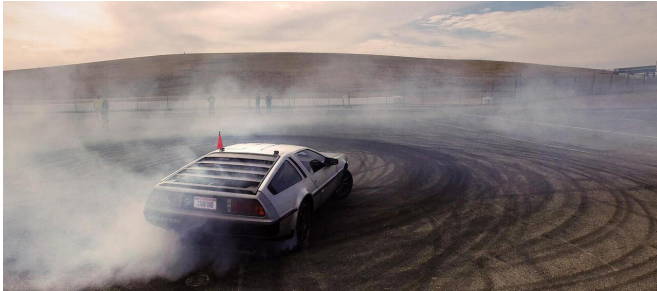
MARTY, the autonomous drifting DeLorean.