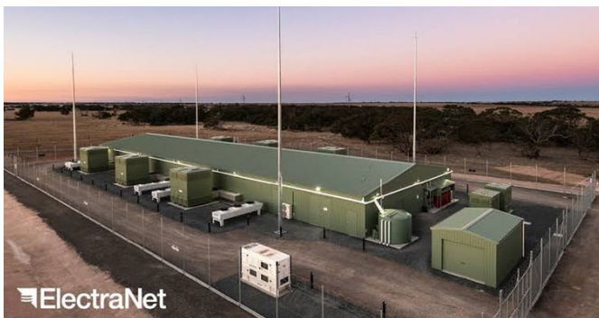
ESCRI battery at Dalrymple in South Australia.

To make the system more resilient, we need to ensure a local area can maintain power even when power is cut off elsewhere. This is feasible with microgrids.