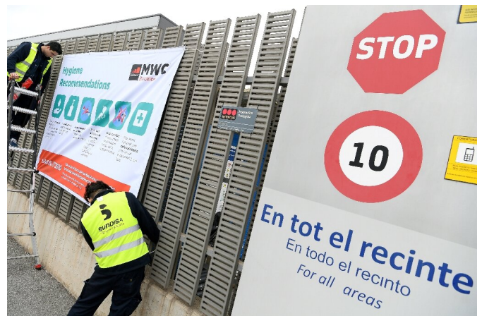
Hygiene recommendations had been posted outside the Mobile World Congress venue

The cancellations began on February 4 when South Korea's LG Electronics, which occupies one of the largest spaces at the show, said it was pulling out to "remove the risk of exposing hundreds of LG employees to international travel... as the virus continues to spread across borders".