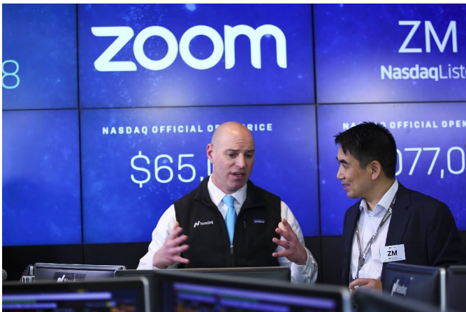
Zoom founder and CEO Eric Yuan (right) is seen at the Nasdaq market debut of the company in April 2019

Yuan vowed this week to step up data security, and apologized.