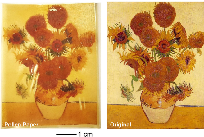
A Van Gogh reproduction printed on pollen paper compared to one printed on regular paper.

The resulting gel-like material is then cast into a mould and left to dry, forming a paper-like material. Using scanning electron microscopy , the scientists observed that the pollen-based paper comprises alternating layers of pollen particles, with the top layer significantly rougher than the bottom layer.