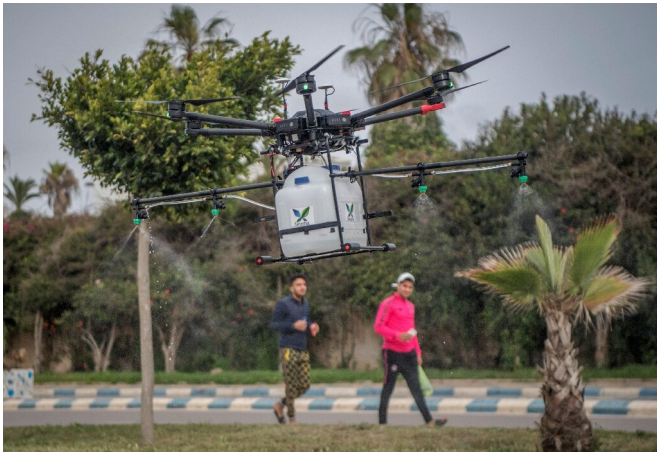
Morocco is trialling high tech solutions like disinfectant-spraying drones to help fight the new coronavirus

Morocco has rapidly expanded its fleet of drones as it battles the coronavirus pandemic, deploying them for aerial surveillance, public service announcements and sanitisation.