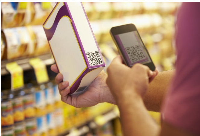
QR tagging in action.

To reassure parents , Nestlé hired Shanghai-based blockchain developer Techrock to incorporate the technology into its NAN A2 baby formula. They first created product packaging with an inbuilt RFID chip and antenna. Then the firms throughout Nestlé's supply chain recorded data on a public blockchain, including details of ingredients, where they came from, and where the product was produced.