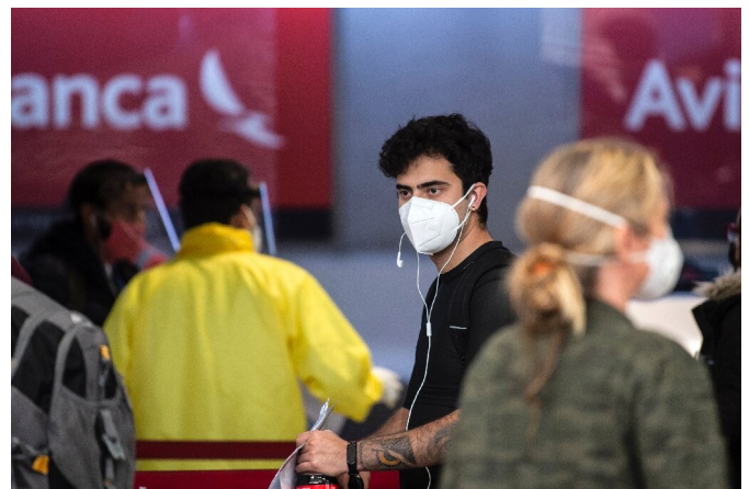
Passengers at the Avianca check-in area in Mexico City's Benito Juarez airport on May 20, 2020

The country's largest, Aeromexico, will resume some routes starting Monday, though ratings agency S&P lowered its credit rating this week due to the possibility of its debt being "unsustainable."