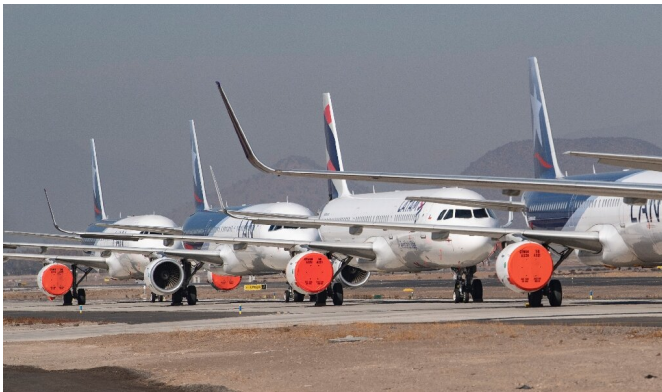
LATAM airlines aircraft sit on the tarmac at Santiago airport

In Argentina, state-owned Aerolineas Argentinas announced a merger with its subsidiary Austral this month to reduce infrastructure and staff to save up to $100 million.