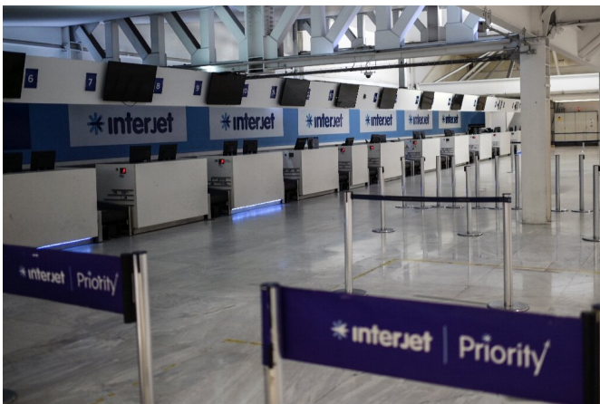
A hall at Benito Juarez International airport in Mexico City on May 20, 2020

Governments are conscious of the broader effects and Chile is considering a bailout for LATAM, seeing the airline as vital to the economy, and seeking to preserve 10,000 direct jobs as well as the livelihood of up to 200,000 people the government says are dependent on the airline indirectly.