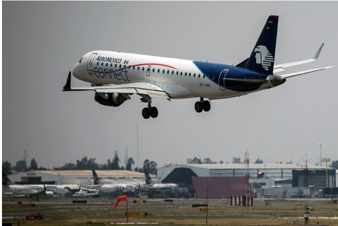
Latin American airlines face $15 billion in losses over the coronavirus pandemic