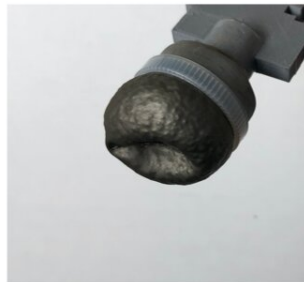
Large rocky obstacle

the foot reduced by 62 percent the depth of penetration in the sand on impact; and reduced by 98 percent the force required to pull the foot out when compared to a fully rigid foot.