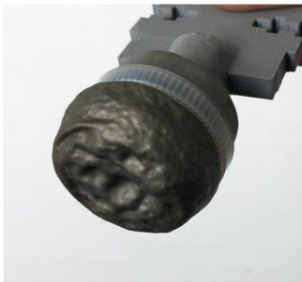
Small rocky obstacle