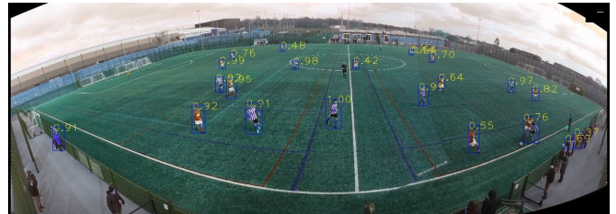
Example of how the tech tracks players.

This is problematic as it is hard to record the whole field of view and the players can run in or out of the image view, so it is hard to track them.