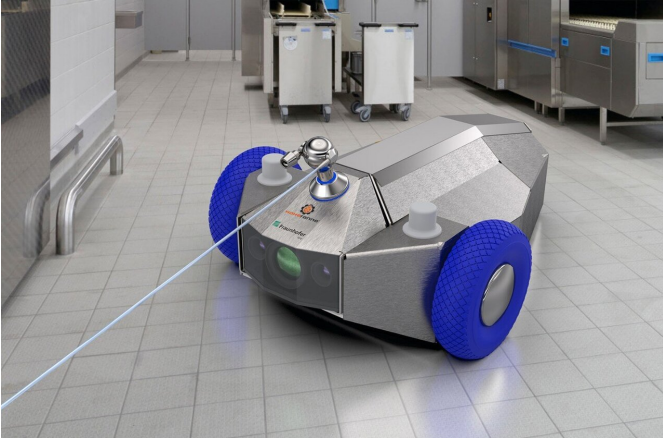
Just a single hose connects the battery-powered robot to the docking station.

detected fouling to a 3-D model of the plant. The water pressure can then be adjusted and reduced, depending on the distance between the device and the surface—all in the interest of using resources efficiently.