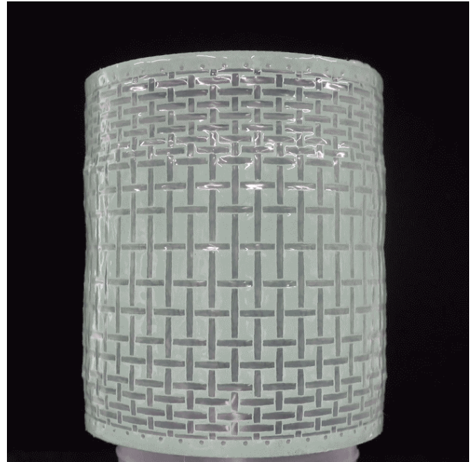
This programmable balloon could pave the way for new shape-morphing devices

"By controlling the expansion at every level of the kirigami balloon, we can reproduce a variety of target shapes," Lishuai Jin, a graduate student at SEAS and co-first author of the paper.