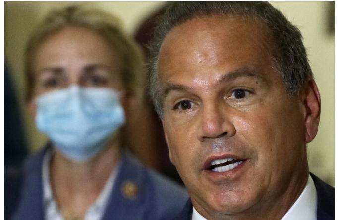
Representative David Cicilline chairs the committee holding Monday's hearing with Big Tech CEOs

Experts say there are limited remedies under existing law and precedent to deal with tech platform dominance.