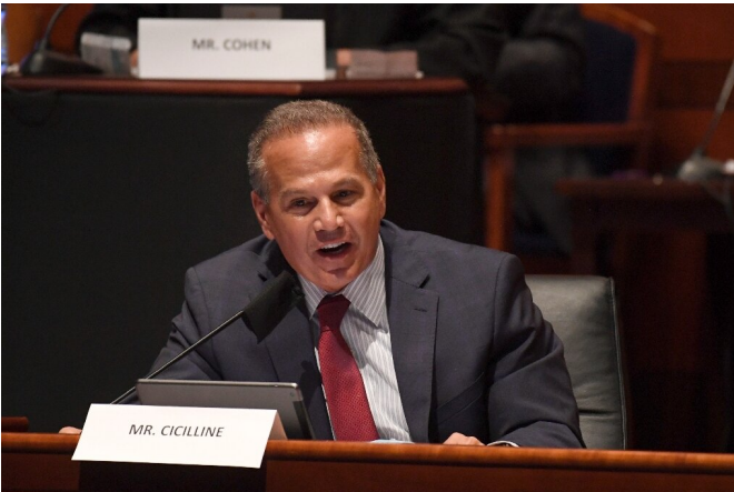
Rep. David Cicilline heads the House of Representatives panel holding the antitrust hearing on Big Tech

TikTok welcomes "fair competition" chief executive Kevin Mayer said in a blog post, while adding that "without TikTok, American advertisers would again be left with few choices."