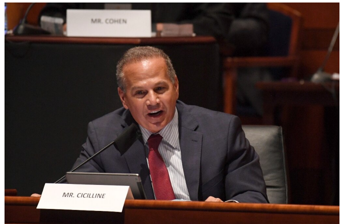
Rep. David Cicilline heads the House of Representatives panel holding the antitrust hearing on Big Tech

The hearing is part of a congressional probe into "online platforms and market power" and takes place against a backdrop of antitrust investigations in the United States, Europe and elsewhere.