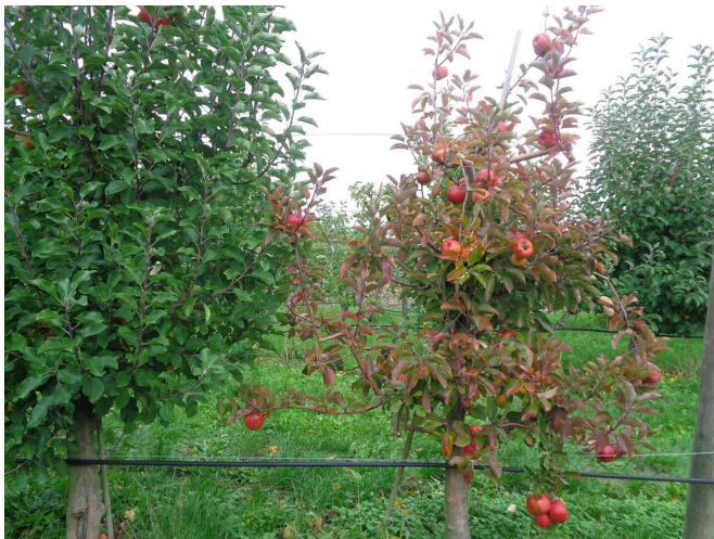
A tree infected with apple proliferation displays symptoms of leaf reddening and small fruit.

The apple is Germany's favorite fruit. Pears rank sixth in annual per capita consumption. Yet apple and pear trees both frequently suffer from diseases: Apple proliferation and pear decline are widespread in European fruit growing. Fraunhofer research scientists, together with partners, are seeking ways to detect disease symptoms early. They are using satellite images and hyperspectral analysis to detect disease infestation from the air in order to replace time-consuming field assessments and laboratory analyses in the future. Machine learning methods are a key technology for the analysis of disease symptoms.