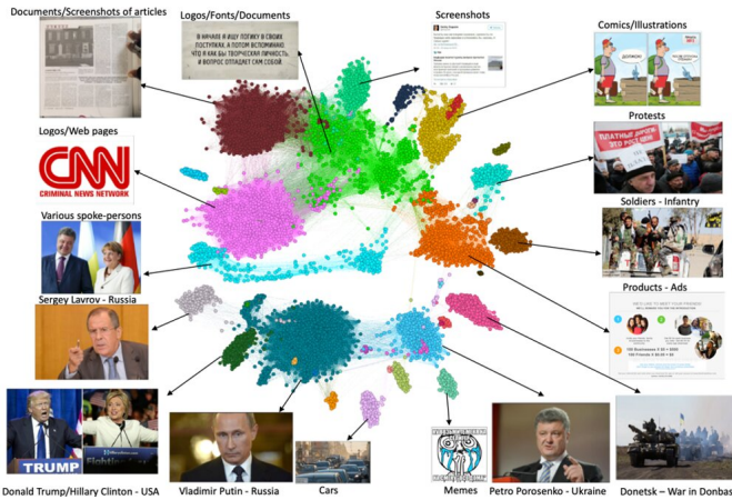
Topics of posts from Russian-sponsored trolls on Twitter.

This article is republished from The Conversation under a Creative Commons license. Read the original article .