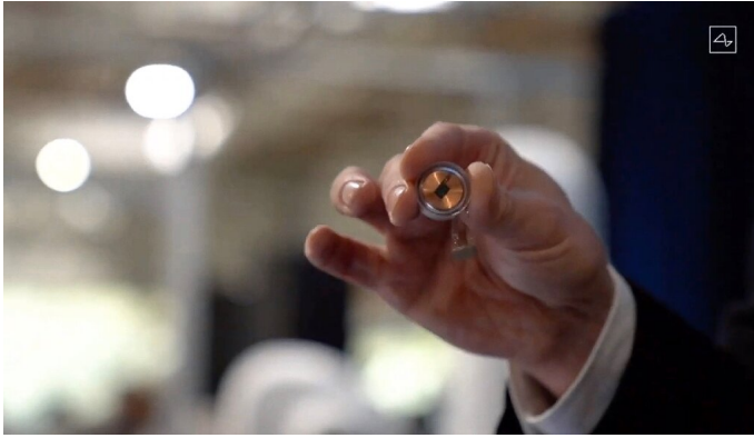
This video grab made from the online Neuralink livestream shows Elon Musk holding the Neuralink disk implant during the presentation on August 28, 2020