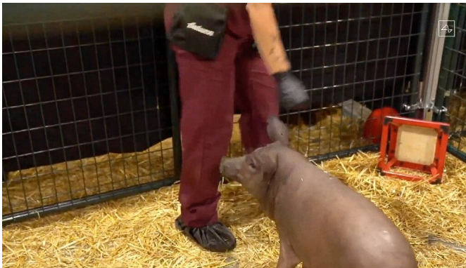
This video grab made from the online Neuralink livestream shows Gertrude, the pig implanted with a Neuralink device during a presentation on August 28, 2020

But Musk's proposal goes beyond this. Neuralink wants to build on those existing medical treatments as well as one day work on surgeries that could improve cognitive functioning, according to a Wall Street Journal article on the company's launch.