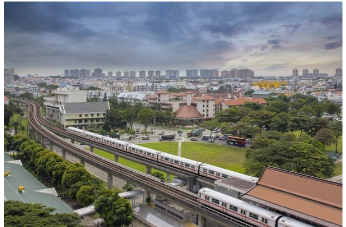
Cut cars, expand public transport.

But it does represent an attack on modern life in many other ways. This vision can't be reconciled with a system that requires permanent growth in economic output to maintain employment levels, or one that incentivises shifting factories to places where rampant ecological destruction is inevitable and wages are barely sufficient for basic subsistence.