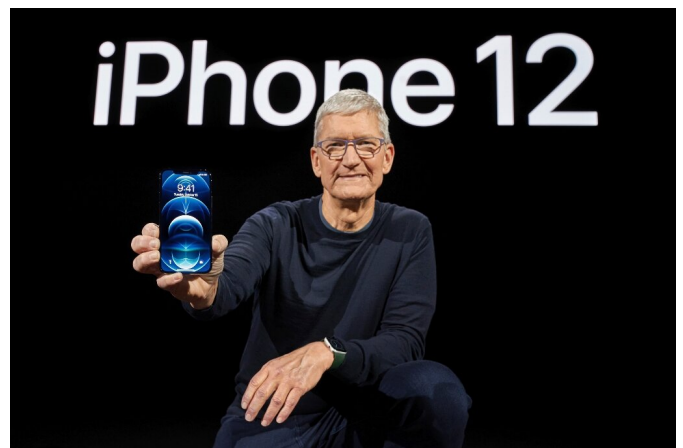
In this photo released by Apple, Apple CEO Tim Cook holds up the all-new iPhone 12 Pro during an Apple event at Apple Park in Cupertino, California on October 13, 2020

The new lineup of iPhones was expected to ignite a surge in interest in smartphone upgrades to take advantage of the faster networks.