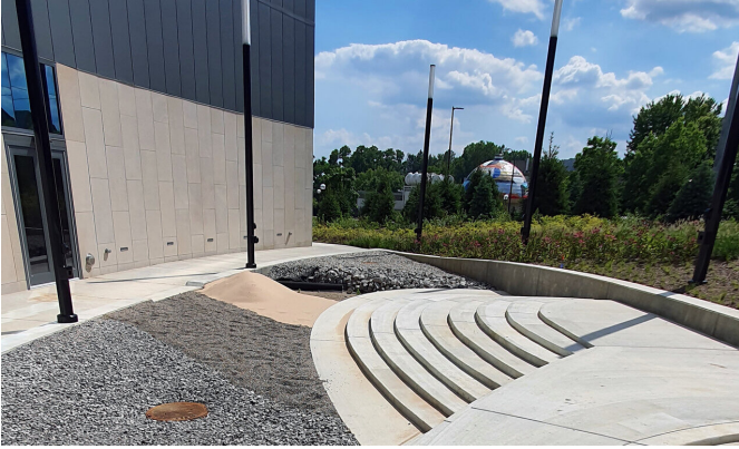
The Robot Garden. This project is a testing ground for bipedal robots. The Robotics Department of the University of Michigan was the client for this project, which is the first architecture project that was designed entirely using Neural Networks.