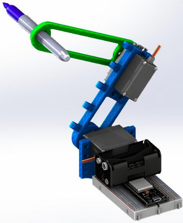
CAD render of the robotic arm assembly including the microcontroller and battery pack. Credit: Benitez et al.

Researchers at Tecnológico de Monterrey in Mexico have recently created a low-cost robotic arm that could enhance online robotics education, allowing teachers to remotely demonstrate theoretical concepts explained during their lessons. This robotic arm, presented in a paper published in Hardware X , is fully open source and can be easily assembled by all teachers and educators worldwide.