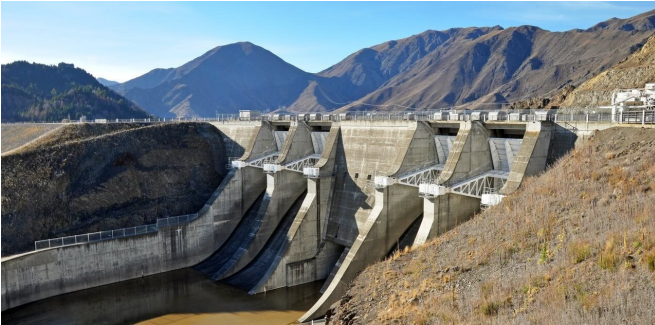
Concrete spillway from Lake Benmore Dam in Otago, New Zealand.

As fossil fuels are phased out over the coming decades, the Climate Change Commission (CCC) suggests electricity will take up much of the slack, powering our vehicle fleet and replacing coal and gas in industrial processes.