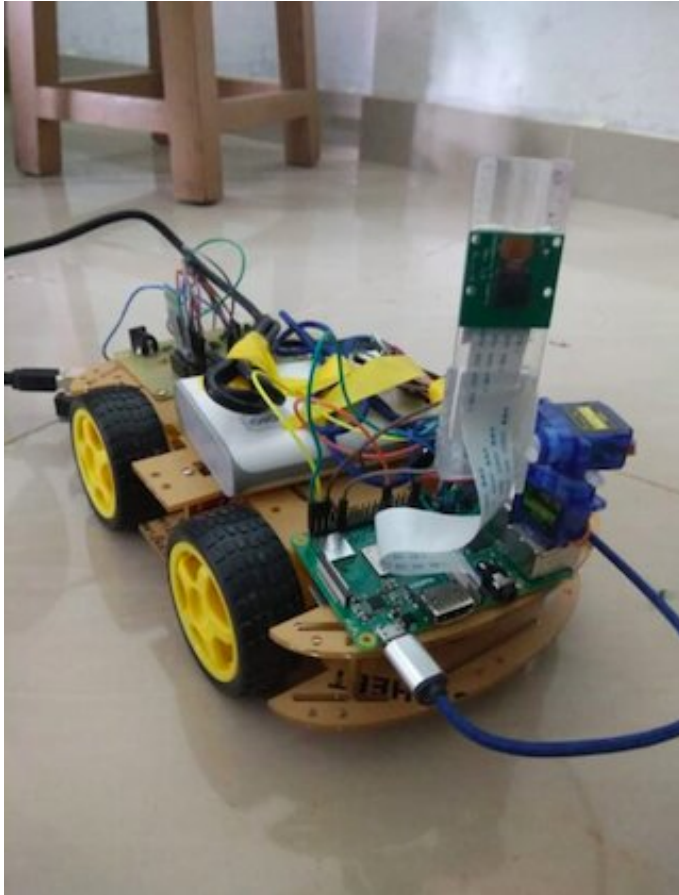
The virtual telepresence robot created by the researchers.

Essentially, the data collected by the accelerometers and gyroscopes in a user's smart phone is used to determine his/her head movements. This data is transferred to a Raspberry Pi device and then used to control the movements of the robot's camera, to ensure that they match a user's head movements.