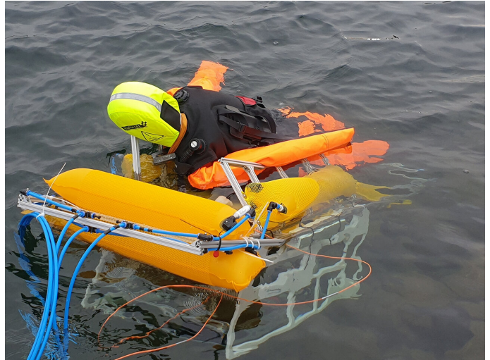
The aquatic robot transports the dummy to shore via the shortest route.

This has been proven to work in practice, through the very impressive open-water testing that researchers conducted at the Hufeisensee lake in Halle (Saale). An 80-kilogram dummy was deposited at a depth of three meters. The robot then picked it up, secured it in place, brought it to the surface within a second, and carried it via the shortest route—a distance of 40 meters—to shore, where the rescue team was already waiting. When the robot is informed of an emergency, a signal alerts the team immediately. "The full rescue operation lasted just over two minutes. Casualties must be resuscitated within five minutes to avoid long-term damages of the brain. We were able to stay within this critical time frame without any problems," says Renkewitz.