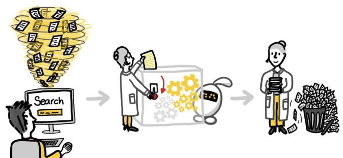
The ASReview workflow for interactive machine learning on systematic literature reviews.

The machine learning framework created by de Bruin, van de Schoot and their colleagues is optimized to find a metaphorical 'needle' or multiple 'needles' in a haystack. As scientists conduct large amounts of research about a variety of different topics, automatically identifying the most relevant studies about a given topic can be highly valuable. To do this, de Bruin, van de Schoot and his colleagues trained their machine learning model using an interactive approach called active learning.