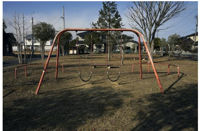
An empty playground in Namie, February 2021.

The World Health Organization documented the upheaval of the Chernobyl disaster among the relocated community and found a legacy of depression and alcoholism . Across the population, a rise in suicide and substance abuse can shorten evacuees' lives far more than might have been lost to radiation in their old homes. Similar evidence is starting to emerge from Fukushima, especially for male suicide .