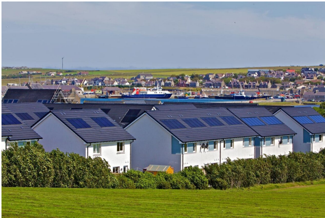
Orkney.

Governments throughout the world have accelerated their ambitions towards effective climate change mitigation. What is clear, in this challenge of how to tackle the complex and global issue of climate change, is that there is no one technology or stakeholder that will drive the full and timely decarbonization that the world and its citizens require.