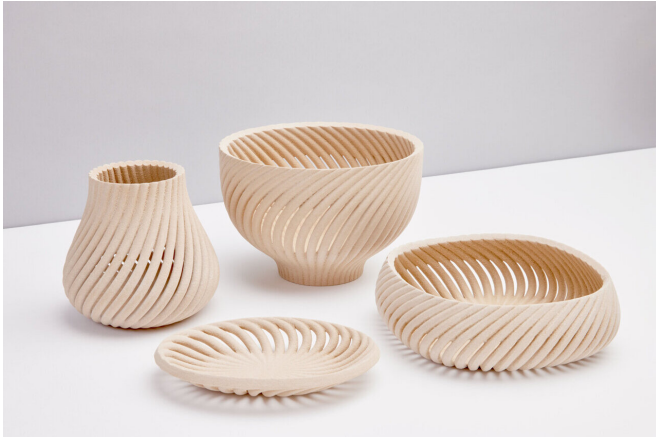
Desktop Metal.

The 3D printing company Desktop Metal has just announced the release of Forust, a new tool using wood to 3D print objects. The company, founded in 2019, focuses on 3D printing for interior design. With printing methods deemed "non-destructive", they haven't come under much scrutiny for safety or environmental concerns, making them an attractive prospect for acquisition.