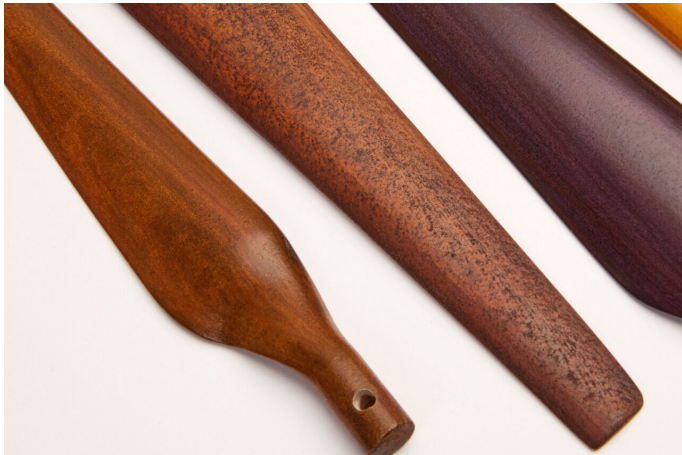
Desktop Metal.

Alongside Forust, Desktop Metal's recent filing reports that the company has also acquired a new technology asset from the sheet metal printing company Figur Machine Tools for $3.5 million. These activities both followed up Desktop Metal's announcement of intentions to go public back in August of 2020, for a value of $2.5 billion.