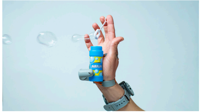
The 'Third Thumb' device being used to blow bubbles single-handedly.

A week later, some of the participants were scanned again, and the changes in their brain's hand area had subsided, suggesting the changes might not be long-term, although more research is needed to confirm this.