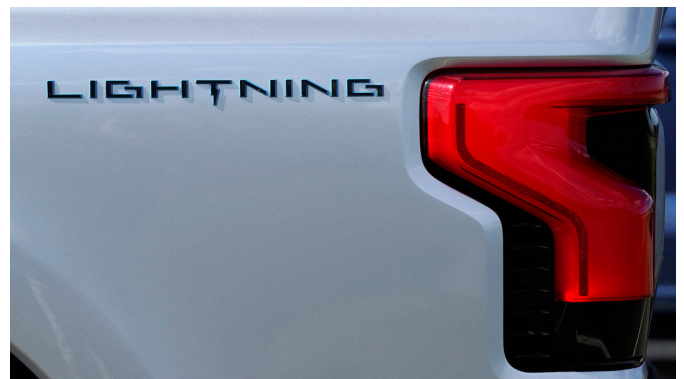
A pre-production Ford F-150 Lightning is shown in Bruce Township, Mich., May 12, 2021. The electric truck is aimed at the heart of the American auto market, a deliberate effort by Ford to move electric vehicles from specialized niche products to the mainstream.

Perhaps the most surprising thing about the truck is its price, which Ford said is about equal to a comparably equipped gasoline F-150. With a federal tax credit of up to $7,500 still available on Ford electric vehicles, the base price falls to around $32,500. That's below the lowest-priced gas F-150 with a crew cab, which starts at roughly $37,000.