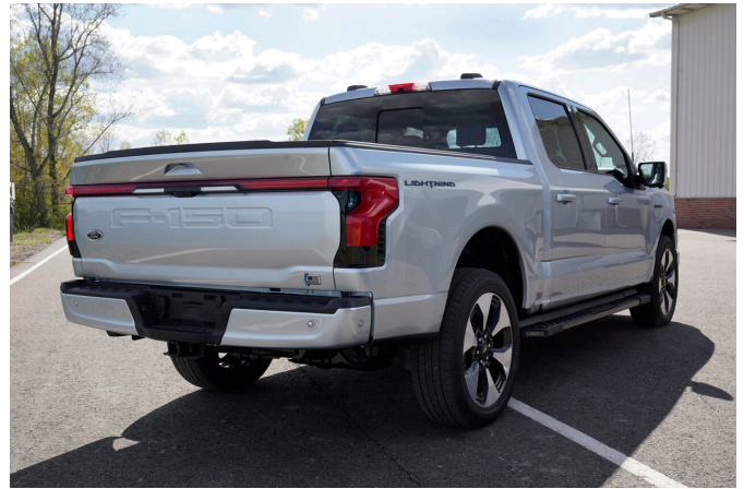
A pre-production Ford F-150 Lightning is shown in Bruce Township, Mich., May 12, 2021. The electric truck is aimed at the heart of the American auto market, a deliberate effort by Ford to move electric vehicles from specialized niche products to the mainstream.