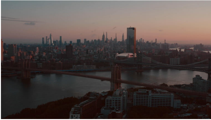
Kelekona drone bus.