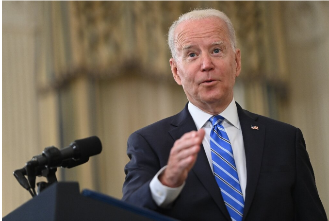
US President Joe Biden says that China has protected cyber criminals.

It was backed up by the embassy in Australia, as China took a coordinated stance of its own, accusing Canberra of "parroting the rhetoric of the US."