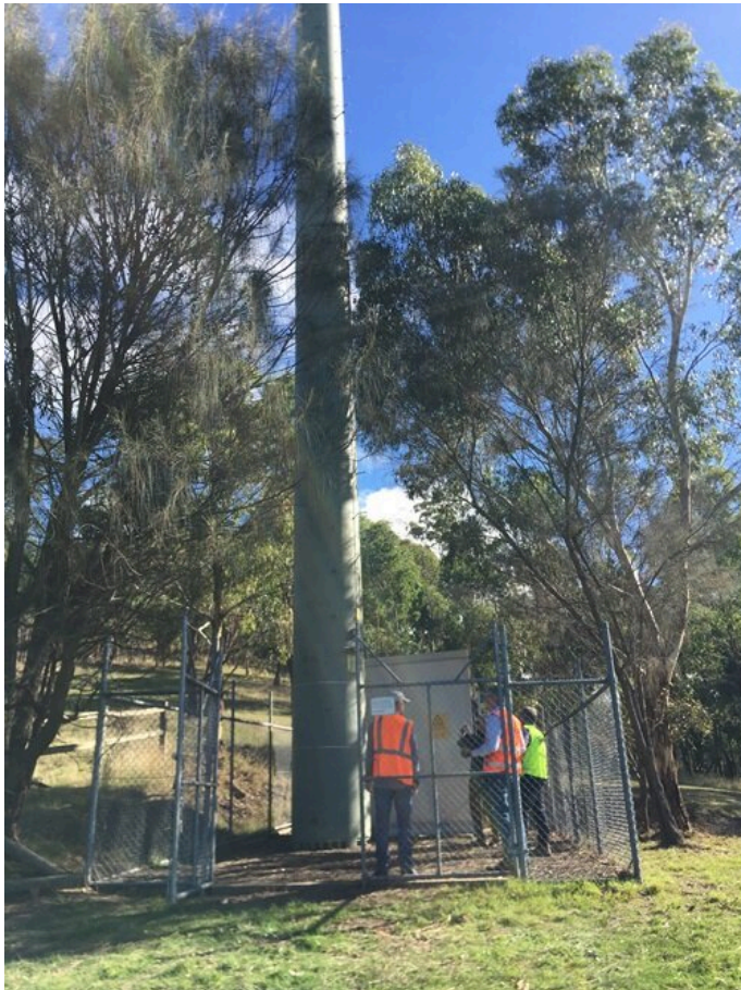
Optus infrastructure at Dixon's Creek in Victoria.

preparedness. It has started training its contractors to improve future design and builds, or to call out existing site concerns.