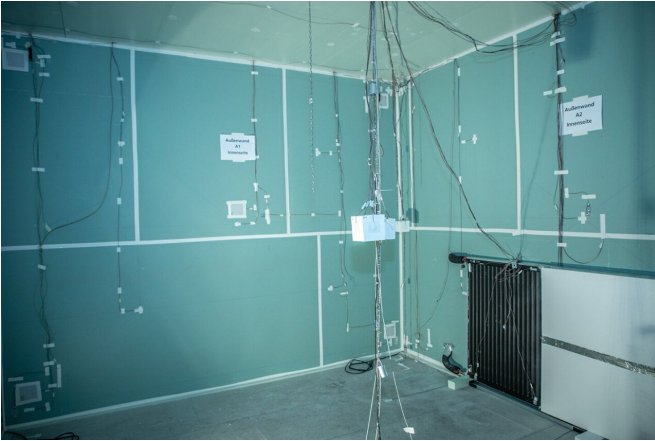
View of the corner of the test room with radiator.

Climate change is causing a persistent increase in the number of hot summer days. Offices and homes are getting hotter, and the nights bring little respite from the heat. Against this backdrop, a significant increase in new cooling systems installations is anticipated, which in turn will give rise to increased energy consumption. One potential cost-effective alternative is to use existing heating systems. According to an analysis by the Fraunhofer Institute for Building Physics IBP, the heat pumps in these systems can be reverse operated to provide effective cooling.